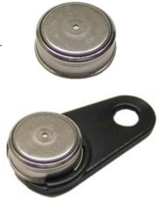
Shown with optional key fob holder

The SL50R Button Reader™ interfaces to the RS232 or USB port of a PC and is totally compatible with the user friendly, TempIT-Lite operating software which enables the logger to be set up and the data read and displayed in graphical format. Data can be stored and retrieved at a later time. The software can be up-graded to TempIT-Pro which provides various additional features such as data table view, export data to spreadsheet, email graphs and automated MKT Calculations etc. The TempIT software also automatically calculates dew point from the measured temperature and relative humidity readings.